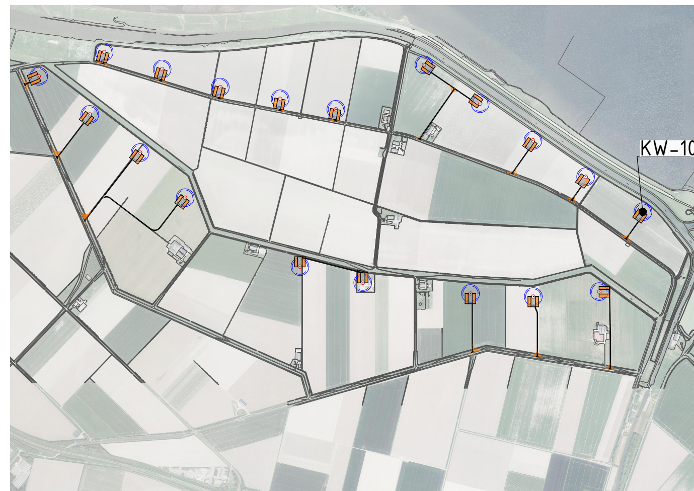
SITUATIE schaal 1:25.000